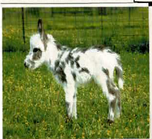
HHA Tanasi 2.jpg

The American Donkey and Mule Society, PO Box 1210, Lewisville TX 75067 www.lovelongears.com/ (972) 219-0781 The American Donkey and Mule Society is not responsible for errors in information submitted to the registry.