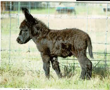
HHAA Spotless 2.jpg

The American Donkey and Mule Society, PO Box 1210, Lewisville TX 75067 www.lovelongears.com/ (972) 219-0781 The American Donkey and Mule Society is not responsible for errors in information submitted to the registry.