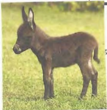
HHA Paper Doll House 2.jp

The American Donkey & Mule Soc PO Box 1210 Lewisville TX 75067 (972) 219-0781 www.lovelongears.com