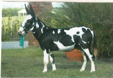
HHA Goosebumps 2.jpg

The American Donkey and Mule Society, PO Box 1210, Lewisville TX 75067 www.lovelongears.com/ (972) 219-0781 The American Donkey and Mule Society is not responsible for errors in information submitted to the registry.