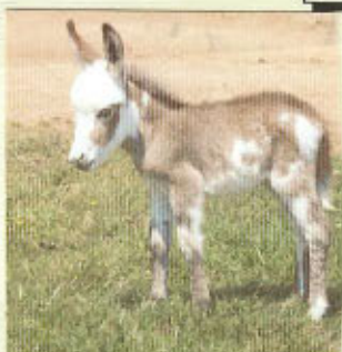
HHAA Butterfly Kisses

The American Donkey and Mule Society P.O. Box 1210, Lewisville, TX 75067 (972) 219-0781 The American Donkey and Mule Society is not responsible for errors in information submitted to the registry.